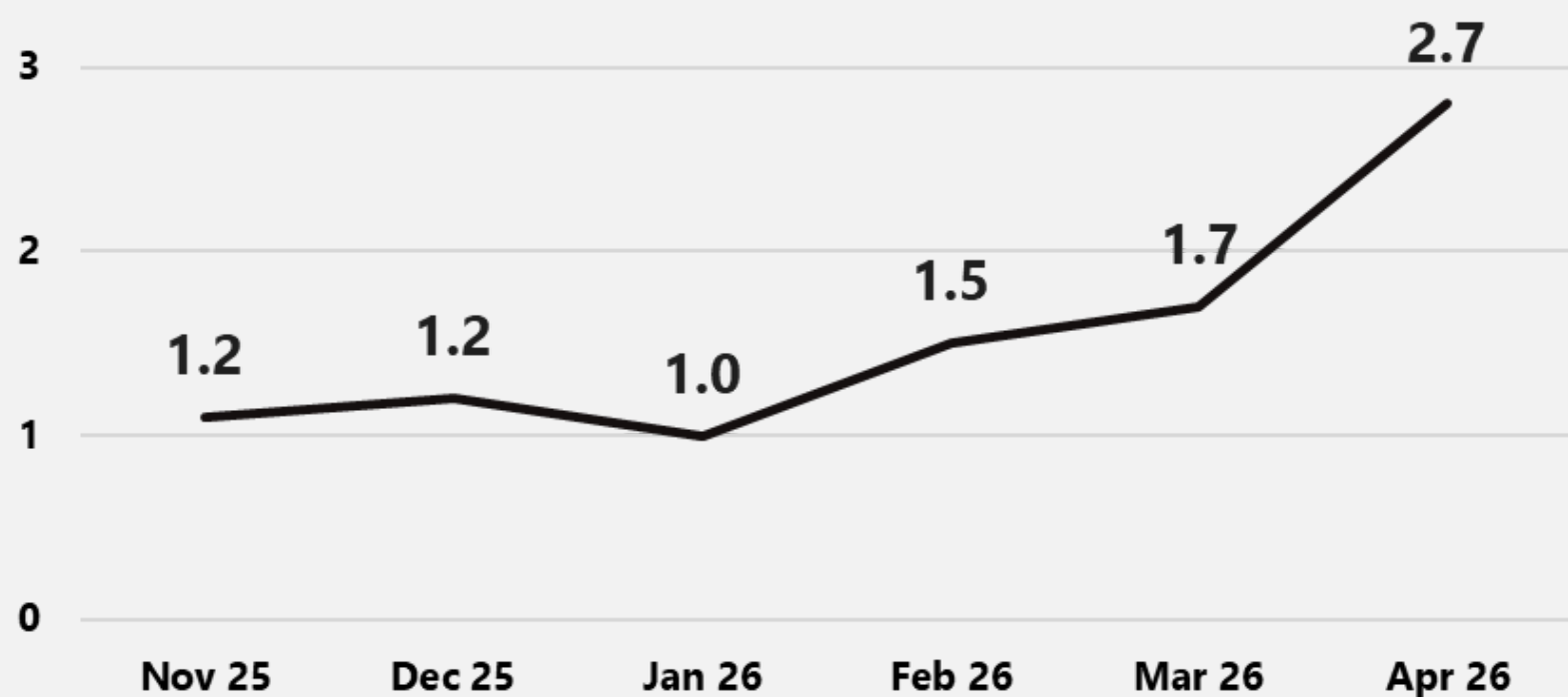
NATIONAL CONSUMER PRICE INDEX (NIC) month on same month a year ago % changes base 2015=100

In April 2026 the Italian consumer price index for the whole nation (NIC) was +2.7% on annual basis (up from +1.7% in the previous month).