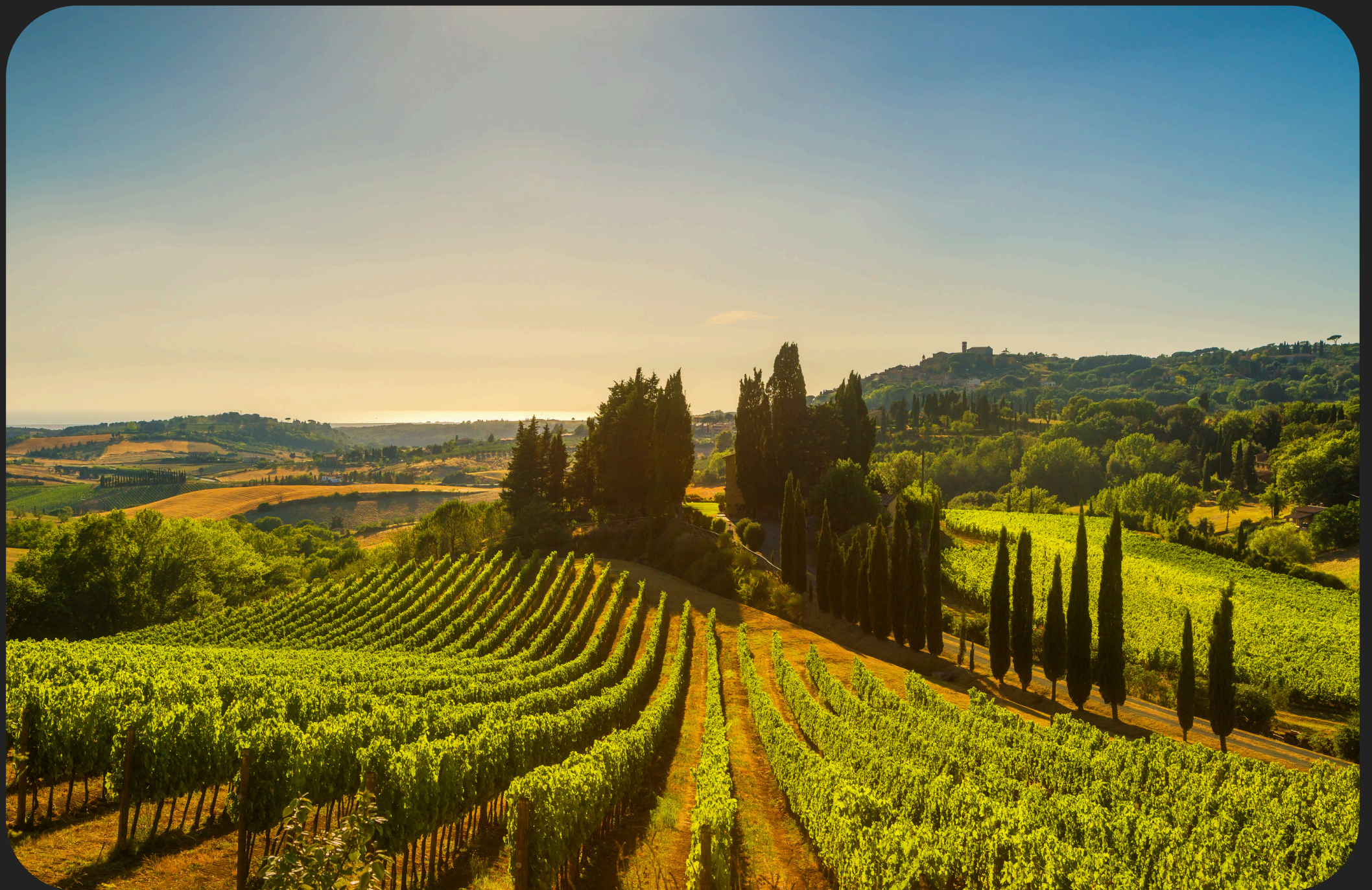
A hilly Tuscan landscape characterised by vineyards, Italy.

Italy at a glance: key indicators and the headlines that mattered over the past few weeks.